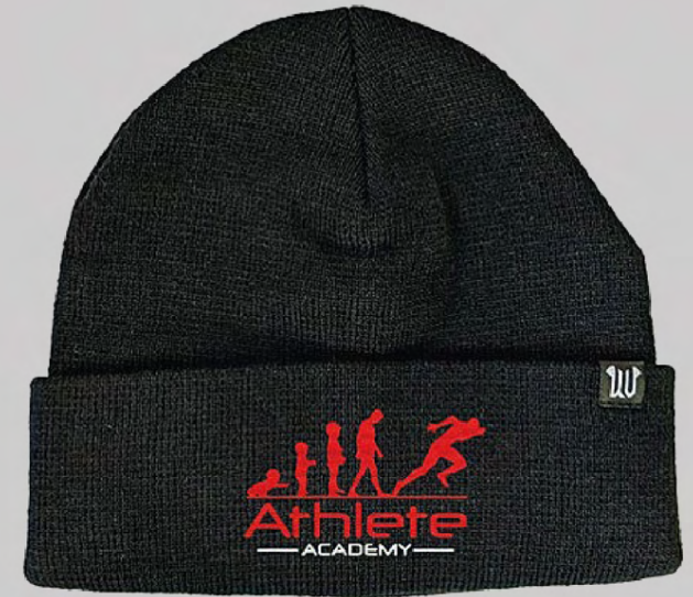
Lightweight, cuffed beanie embroidered with club logo.