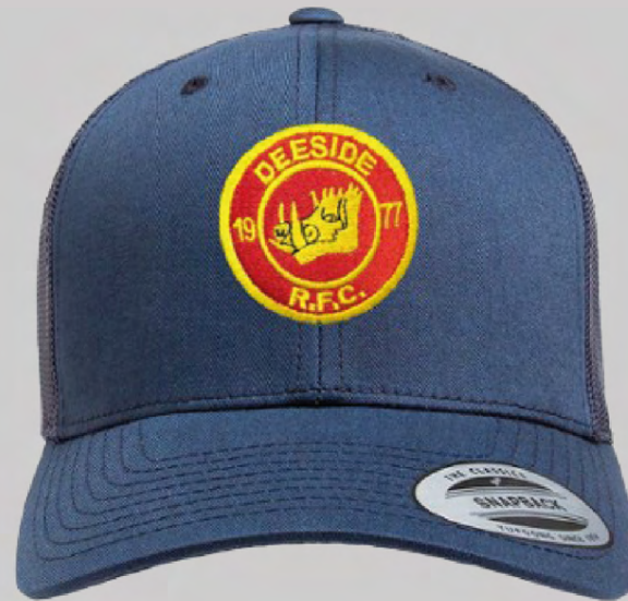
Range of high quality caps in different styles.