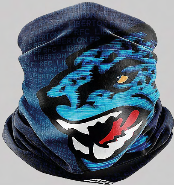
Moisture-wicking performance fabric. Includes antibacterial, silver ions. Made from premium quality, European manufactured fabric.